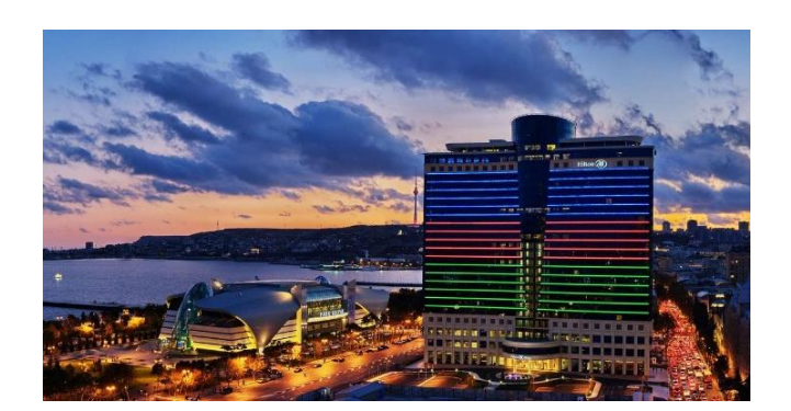
Building 1: 1B Azadlig Avenue Rooftop Bar Sky Grill, Hilton Hotel