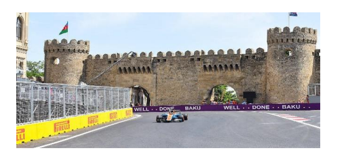
Building 3: Podium on the top of the Gala Gapisi