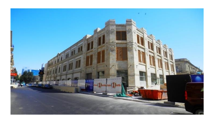
Building 2: 8, Aziz Aliyev Street. Roof of the Cinema Plus Building